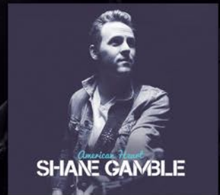
“American Heart” - Coming Soon