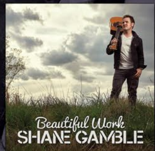
“Beautiful Work” - CD Single Released: 6-24-2014